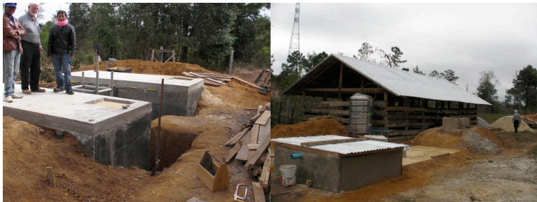
Two 8000 litre tanks with pump stand. Bio-digester and cowshed.

There is plenty to be done to help these people who were so poorly treated in the 1970’s.